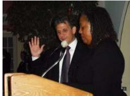
NYCSHP 44th Installation Program Thursday, June 25 th 2009